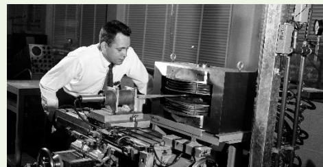
1961 MSU Cyclotron Laboratory