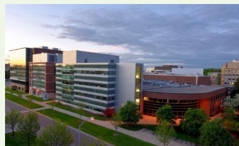
2022 Facility for Rare Isotope Beams (FRIB)