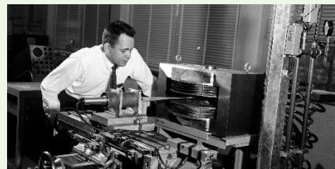
1961 MSU Cyclotron Laboratory