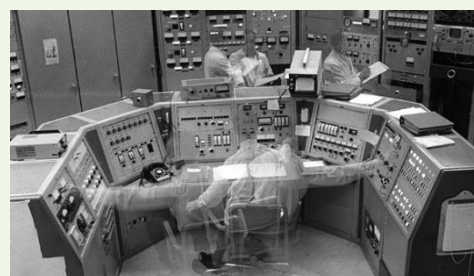
1977 MSU/NSF Heavy Ion Laboratory