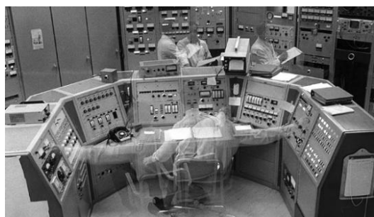
Operating the K50 (circa 1970s)