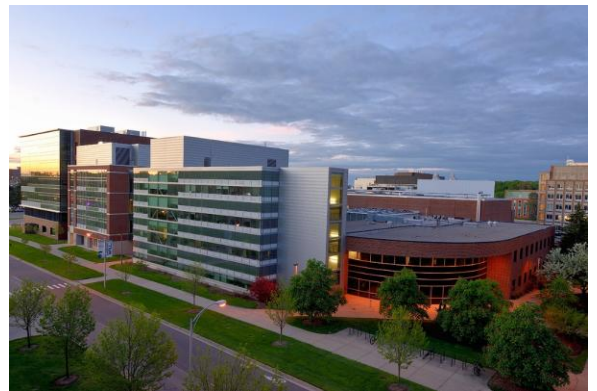
Facility for Rare Isotope Beams (2022)

DOE-SC awarded a cooperative agreement to establish and operate the High Rigidity Spectrometer (HRS) at FRIB in 2023. HRS will have a significant benefit for FRIB's scientific program, extending the scientific reach to neutron-rich isotopes by a combined production-rate and luminosity increase of up to a factor of up to 100.