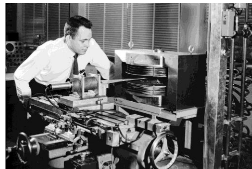
MSU Cyclotron Laboratory (circa 1960s)