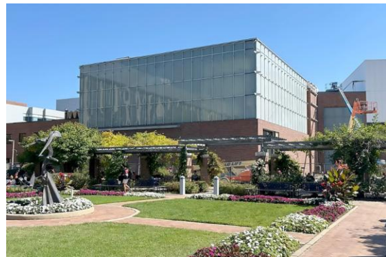
K500 Chip Testing Facility (2025)

KSEE was completed in 2025, providing additional national capability for chip testing. FRIB offers up to 6,000 hours per year.