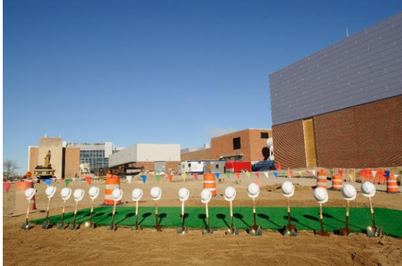
Facility for Rare Isotope Beams groundbreaking (2014)

An NSAC taskforce presented its recommendations on how to proceed to the NSF and DOE in 1999. It closely reflected a plan for rare isotope beam production proposed by MSU.