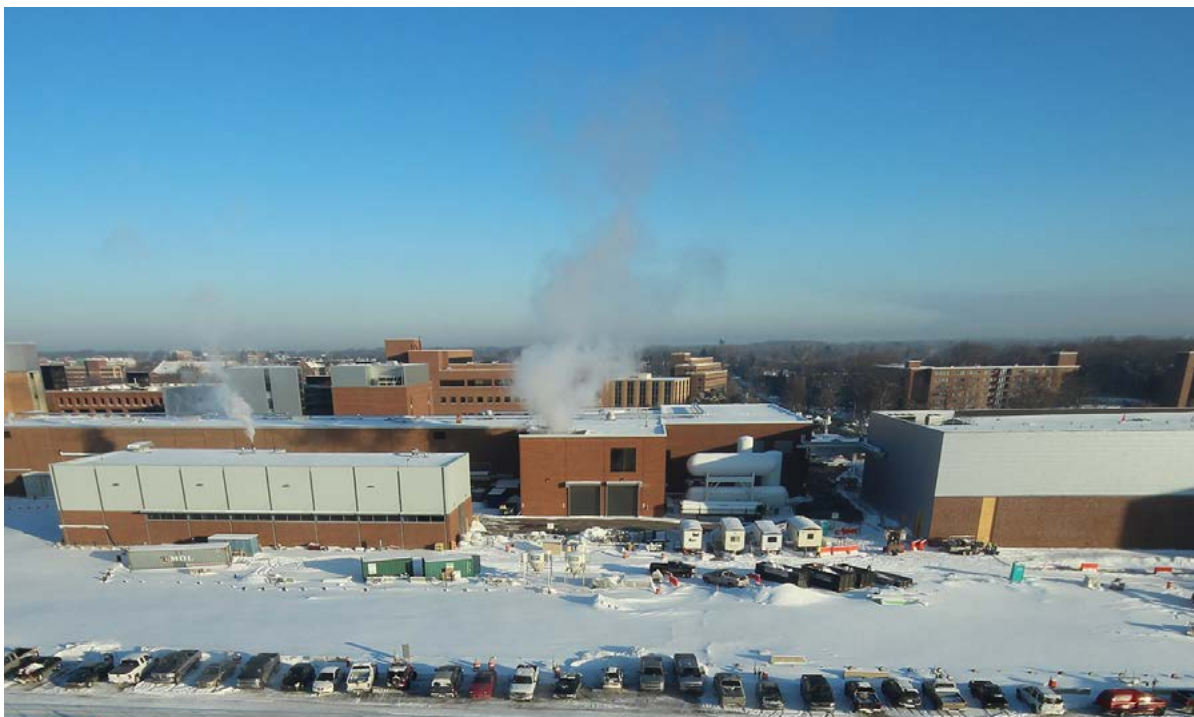
An image of site preparation currently going on at FRIB—taken by a camera mounted on the building directly to the south (facing north)

Follow along with FRIB progress by checking the construction camera at