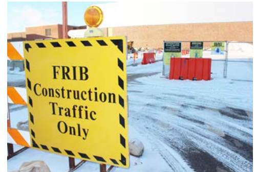
FRIB civil construction will begin in early spring

Throughout the spring, the FRIB project team will hold meetings of the Experimental Systems Advisory Committee (ESAC) and the Accelerator Systems Advisory Committee (ASAC) and host technical design reviews. The project will also undergo safety and quality assessments, all leading up to an MSU President's independent review before, finally, the DOE-SC review for CD-3b in June.